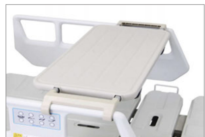
Dining Table (Optional)