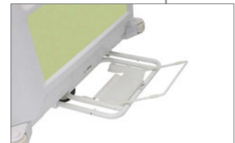
Integrated Controller Shelf