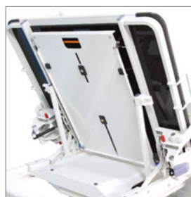
X-Ray Cassette Holder (Optional)