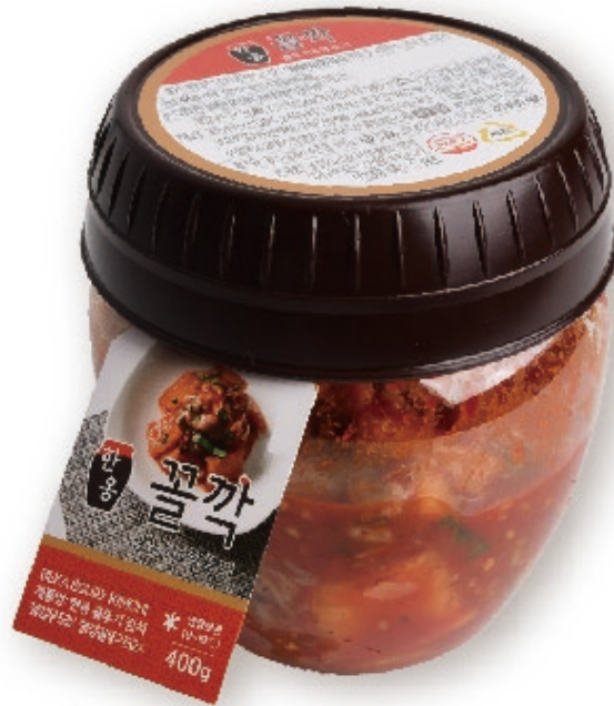
Mouthwatering Kkol Kkak Baby Octopus & Radish Kimchi